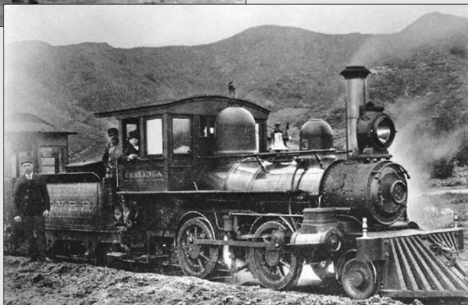
Right: The little engine is standing on Sunset Boulevard at Laurel Canyon in the year 1893. The railway was responsible for the unusual configuration of Crescent Heights which was used as a connection to the Santa Monica Boulevard steam dummy line. There was a rock quarry just west of Laurel Canyon. Trains hauling rocks required large radius curves to turn onto Crescent Heights at Sunset and again at Santa Monica Boulevard. Those curves are still visible to this day.